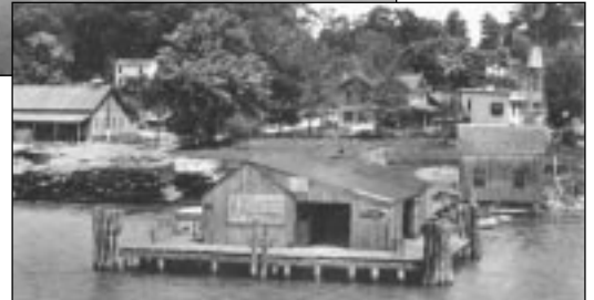
Turn-of-the-Century view of the Leonardtown Wharf waterfront.

Phase II of the Leonardtown Landing Project will be the construction of a public waterfront park and a commercial component. Crozier & Associates has provided a design for the Town's <sup>3</sup>/<sub>4</sub> acre public waterfront park, which will include open park area, picnic grove, kayak landing, public restroom