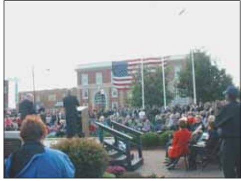
Congressman Steny Hoyer addressing the crowd before unveiling the Deceased Veterans Memorial on November 11, 2001.

A color print of the Leonardtown Mural, depicting a progression of life in the Town during the first half of the 20th Century, is eye-catching on any wall. Capturing a comprehensive history of Leonardtown between 1650-1950, is Aleck Loker's book "A Most Convenient Place". Great as gifts, copies of the mural and book are available in the Town Office or at several local businesses. Call the Town Office at 301-475-9791 for details.