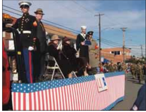
The USO (United Service Organizations) are among the many groups participating in the annual Veterans Day Parade in Leonardtown.