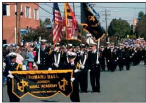
Marching and performing in the annual Veterans Day Parade is a tradition of Leonard Hall Junior Naval Academy, as well as many of our St. Mary's County Schools.