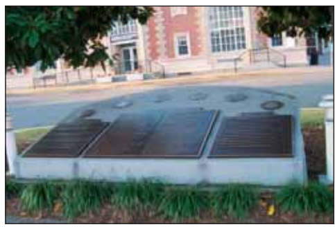
The Deceased Veterans Memorial in the Leonardtown Sauare.