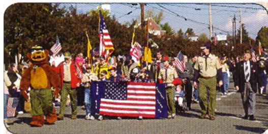
Cub Scout and Webelos Pack 413 from Patuxent River, MD.

Patriotism blared and sunshine shone in Leonardtown during the 2007 Annual Veterans Day Parade on November 11 th . What a fantastic time was had by all the participants, spectators, and volunteers!