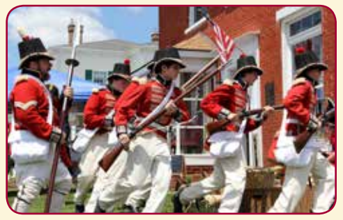
Actors and actresses from The Newtowne Players 1812 Street Theatre, dressed in clothing of the era, enjoyed interacting with the crowd and visiting businesses around the Town Square.