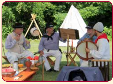
Barney's Irregulars and the Calvert-Arundel Swordsmen gave an impression of crews off the Chesapeake Flotilla in 1814, illustrating camp life of the day, displaying artifacts, singing songs, telling stories, and demonstrating fencing skills.