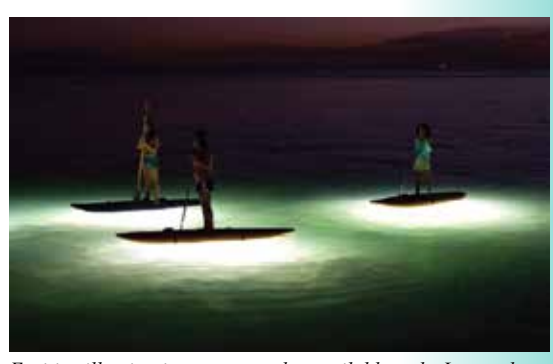
Exciting illumination tours are also available at the Leonardtown locations, where NOCQUA light systems are used to ignite the water beneath you to create an unmatched paddling experience.

McIntosh Run followed by enjoying the tastes of local wines with cheese and crackers – you can even keep the souvenir wine glass.