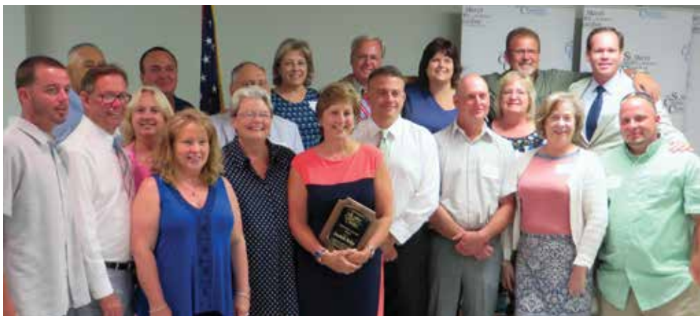
Leonardtown Mayor, Town Council, and Staff