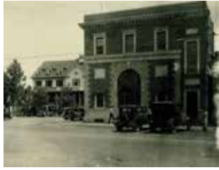
First National Bank and Hotel St. Mary’s

That is why we strive to maintain and restore Leonardtown’s oldest buildings and encourage owners to retrofit and reuse the existing structures, unless they are so deteriorated that they can’t be saved. Some of our oldest buildings around town are getting new lives this year. The Reynold’s Pharmacy building will soon be a coffee and ice cream shop called Panda Village, in addition to two newly renovated apartments that will be going in upstairs. The Corner Critter’s Pet Shop building, now called the Seymour Town Building, houses five new luxury apartments and will soon have a restaurant on the ground floor. The PNC Bank Building, empty for several years now, will have a new life as retail shops on the ground floor and seven new luxury apartments on the second and third stories. The old Bell Motor Used Car Building and its parking lot are now the Washington Street Retail Complex, housing a Dunkin Donuts, Urban BBQ restaurant, REMAX Real Estate, State Farm office and Jessie’s Kitchen restaurant.