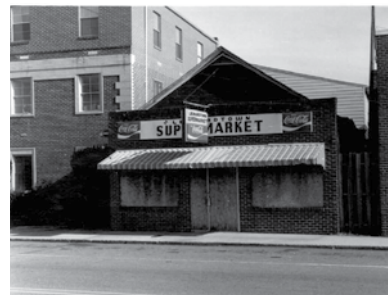
Leonardtowntown Super Market

On Saturday, August 20th the Leonardtown Town Hall moved to its new home at 22670 Washington Street. For the last decade the offices were located in The Proffitt Building, where the Town owned two office condominiums and rented a third. This new building is now owned by the Town in its entirety. The building had a configuration of offices that was a perfect fit with plenty of growing room. The Commissioners plan to sell the condos on Courthouse Drive in the coming months. Currently the public meetings will be held on the first floor, with the hope of adding an elevator in the future and then holding meetings in the wide open space on the second