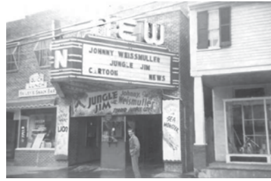
The “New” Theatre Building

and formerly a movie theatre. Ye Olde Town Café was home to St. Mary’s Pharmacy which eventually became CVS Pharmacy. The current location of the Post Office was a Ben Franklin store for many years. The home of The Hair Company was formerly St. Mary’s County’s Planning and Zoning offices and many years ago was also a movie theatre. And who could forget that the iconic Duke Building, built in the 1920’s, was home over the years to a bowling alley, movie theatre, restaurant, grocery store, auto showroom and Greyhound bus depot. Most recently the Duke Building housed the Café des Artistes French restaurant for over 15 years and is today being transformed to La Rive Breton Restaurant.