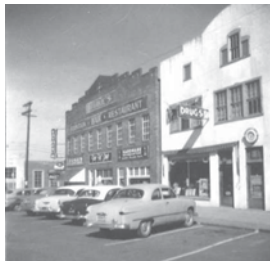
Duke Building and DeWaal’s Store

yard and prefer the simplicity of a condo or apartment. It also benefits Leonardtown to have residents with “eyes on the street” after hours, when the shops and restaurants are closed, to deter crime.