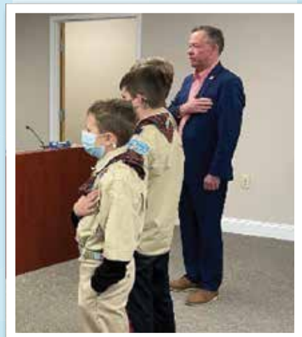
Cub Scouts Pack 420 Lead Pledge of Allegiance at February Town Council Meeting.