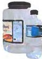
Plastic bottles (necks smaller than base)