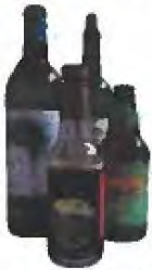
Glass jars & bottles