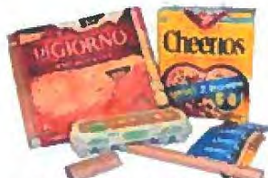
Boxboard, cereal boxes, frozen food boxes