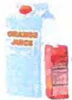
Paper Cartons - Milk cartons and juice boxes