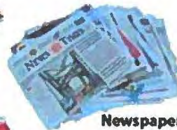
Newspaper & inserts