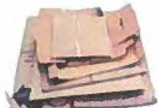
Corrugated cardboard (flattened)