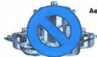
Pots & pans, scrap metal, ceramics