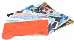
Mail, mixed paper, and catalogs