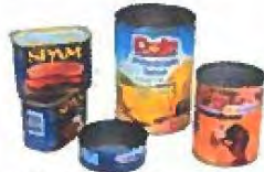
Clean metal food cans