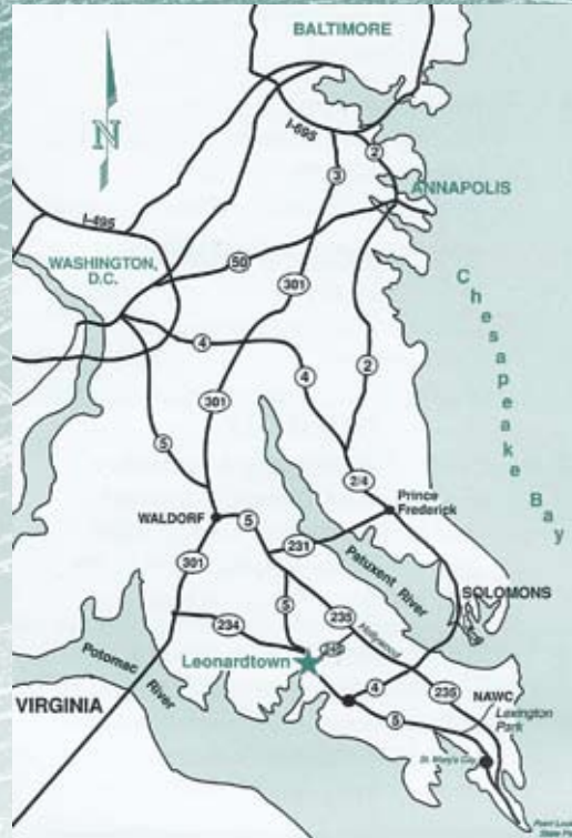
Chart a course for Leonardtown today!

From Baltimore - 90 Miles From Washington - 50 Miles From Waldorf - 30 Miles From Annapolis - 70 Miles