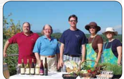
The Port of Leonardtown Winery and The Good Earth teamed together for their "Buy Local" display during Fox 5's Hometown Friday in Leonardtown.