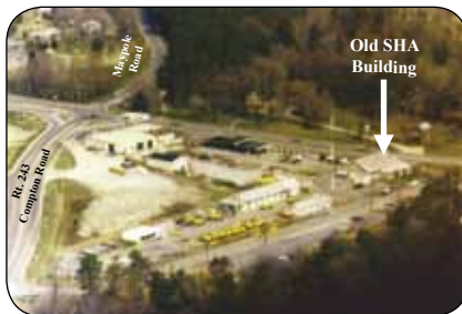
Old SHA Photo.