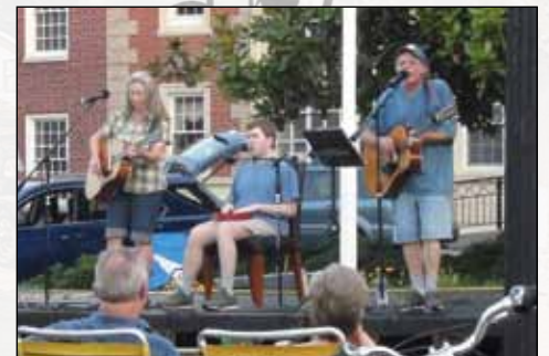
Enjoying acoustic melodies by The Eds and the Hamm-It-Ups during the June 26 th Tunes.