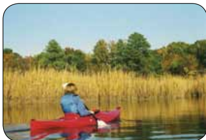
Kayaking on McIntosh Run.