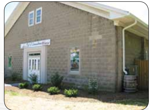
Frontage from Rt. 5