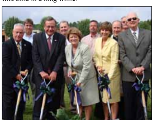
Breaking ground during the recent ceremony at St. Mary's Ryken.