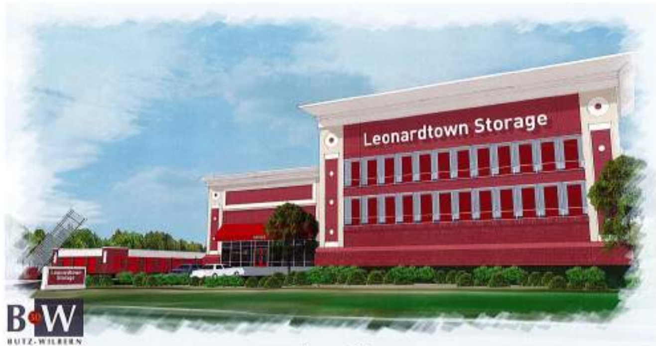
Leonardtown Self Storage Sheet 1 of 3 - Front

Generation Properties, LLC Updated 3D Model Views April 2, 2019