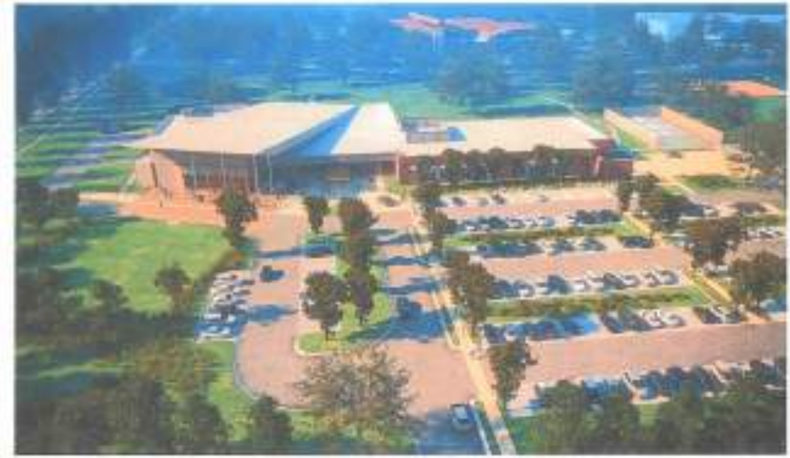
Leonardtown Library and Garvey Senior Activity Center